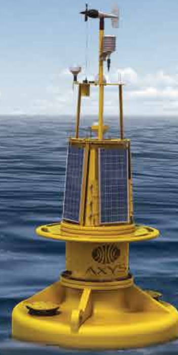
WATCHKEEPER™ Metocean Buoy