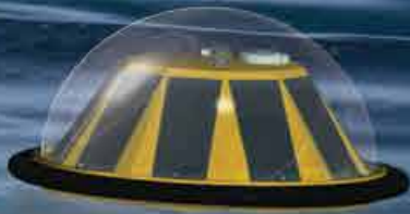
TRIAXYS™ Wave & Current Buoy