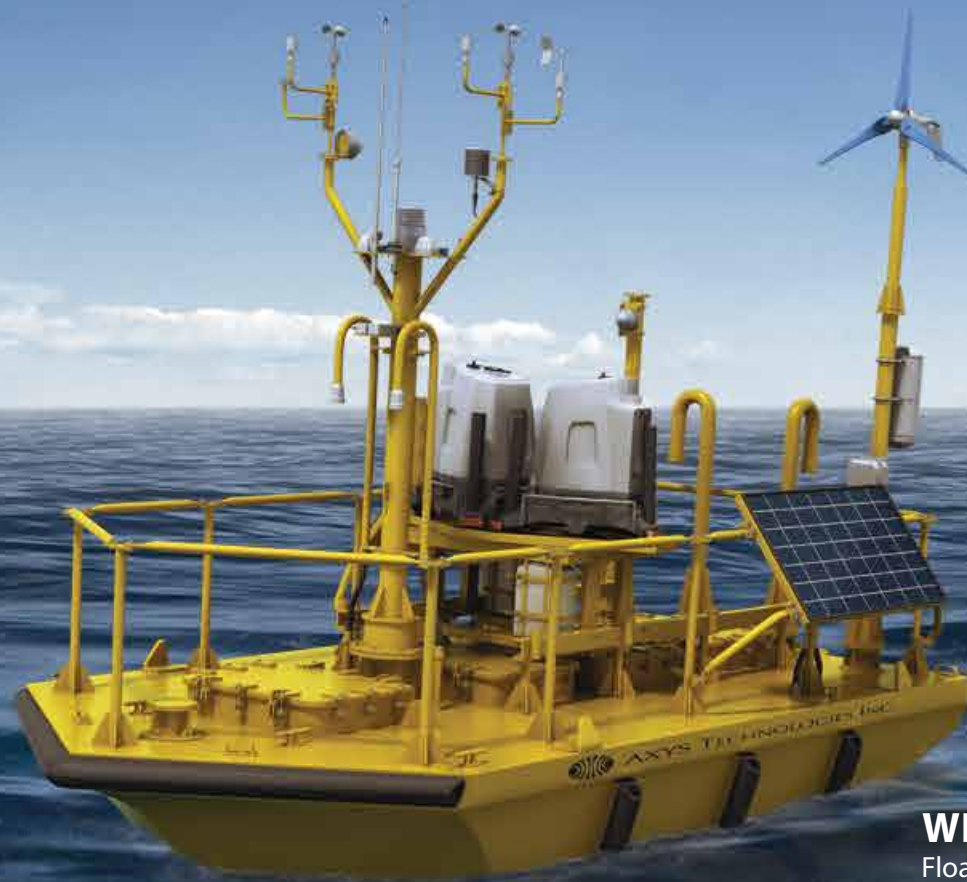
WINDSENTINEL™ Floating Lidar